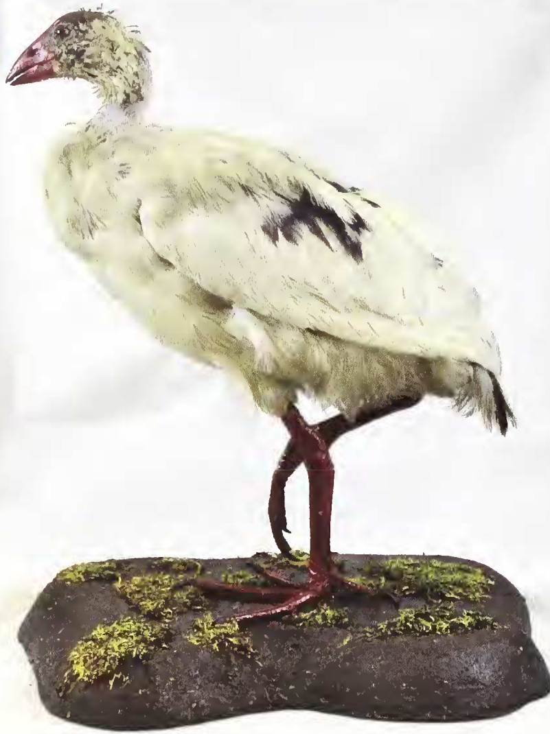
Figure 11. Liverpool specimen of Porphyrio albus (WML D3213), probably collected March or May 1788 on Lord Howe Island, and the type of Porphyrio stanleyi Rowley, 1875, which was probably re-prepared (modelled) after Keuleman's illustration (see Fig. 9) (Hein van Grouw)

with Pelzeln (1860) that Lord Howe Gallinule was more similar to New Zealand Takahe Notornis mantelli and therefore should be placed in Notornis , as shown in the accompanying illustration by J. G. Keulemans (Fig. 10). However, Salvin apparently never saw the Vienna specimen and based his attribution purely on a drawing of it provided to him by Pelzeln, stating: 'I therefore (depending, of course, upon the accuracy of the drawing sent me, which has been placed on stone by Mr. Keulemans on a slightly larger scale than the original sketch) have little hesitation in adding this species to the genus Notornis , thereby confirming the position pointed out for it by Herr von Pelzeln...'. Salvin's caution seems justified as, in our opinion, Pelzeln must have been biased towards Takahe when he provided the sketch.